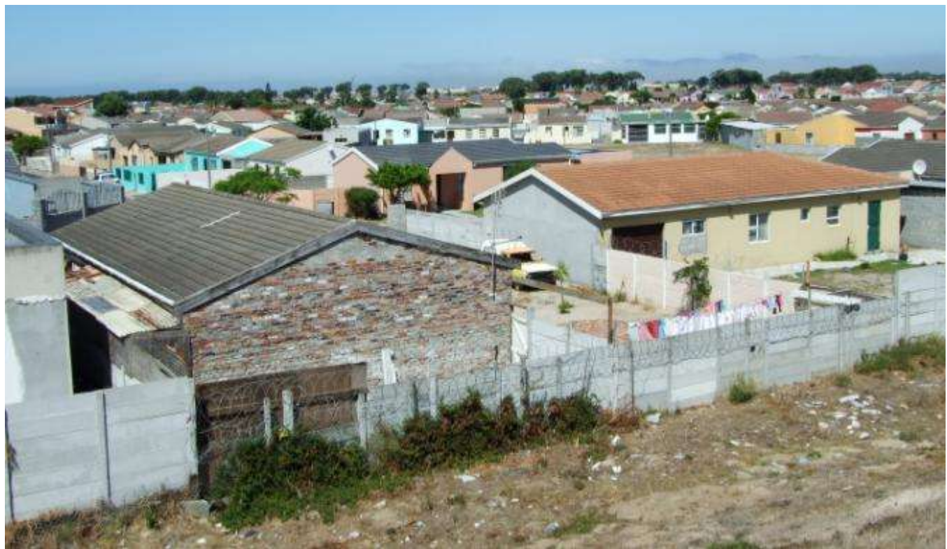
Figure 2: Dense urbanisation in the study area

Figure 1: Typical stands of dense alien vegetation in the study area