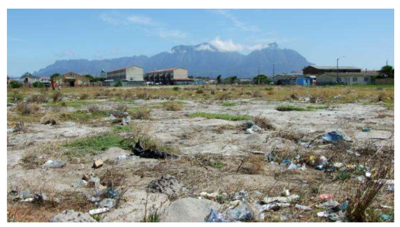
Figure 4: The majority of the habitat in the study area bears evidence of heavy impacts