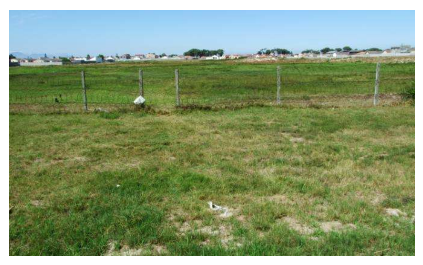
Figure 3: There are a few remaining open areas in the study area