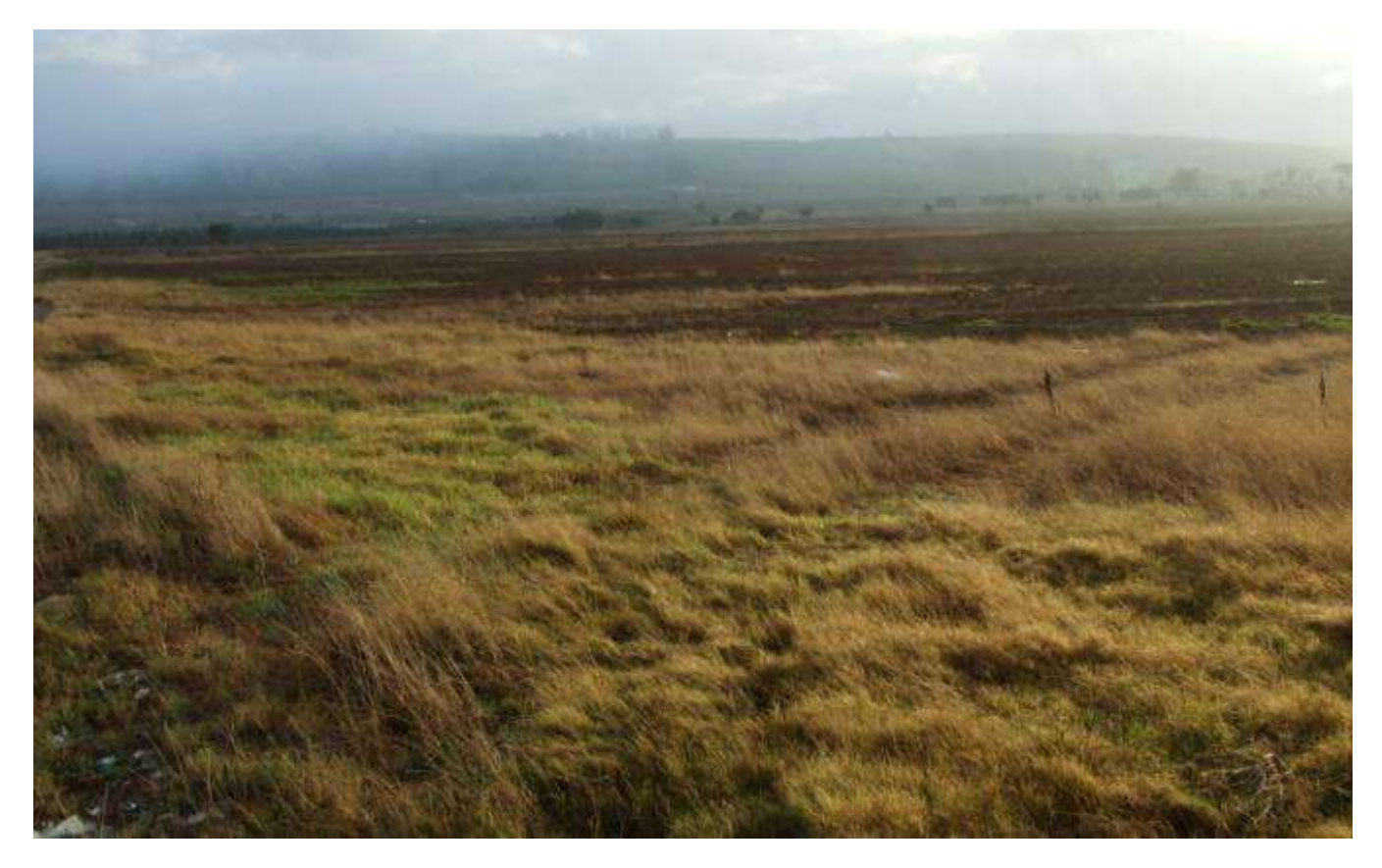
Figure 7: Arable lands that have reverted to a form of grassland is an important bird habitat in the study area