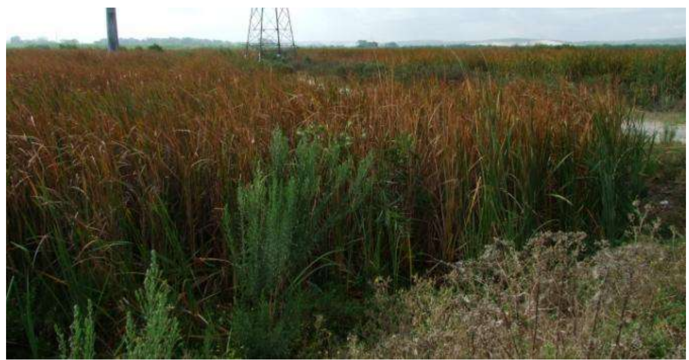
Figure 8: The Kuils River with its associated wetlands is the most prominent drainage line in the study area

Figure 7: Arable lands that have reverted to a form of grassland is an important bird habitat in the study area