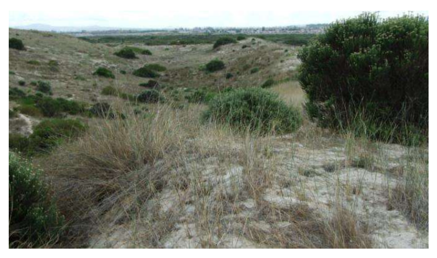
Figure 9: Driftsands Nature Reserve is a degraded island of natural vegetation in the study area