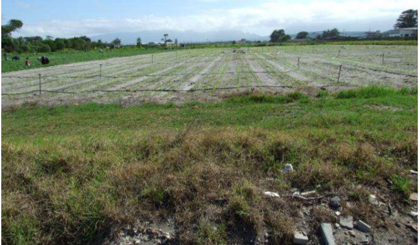
Figure 5: There is limited agricultural activity in the study area, most is located south of Philippi