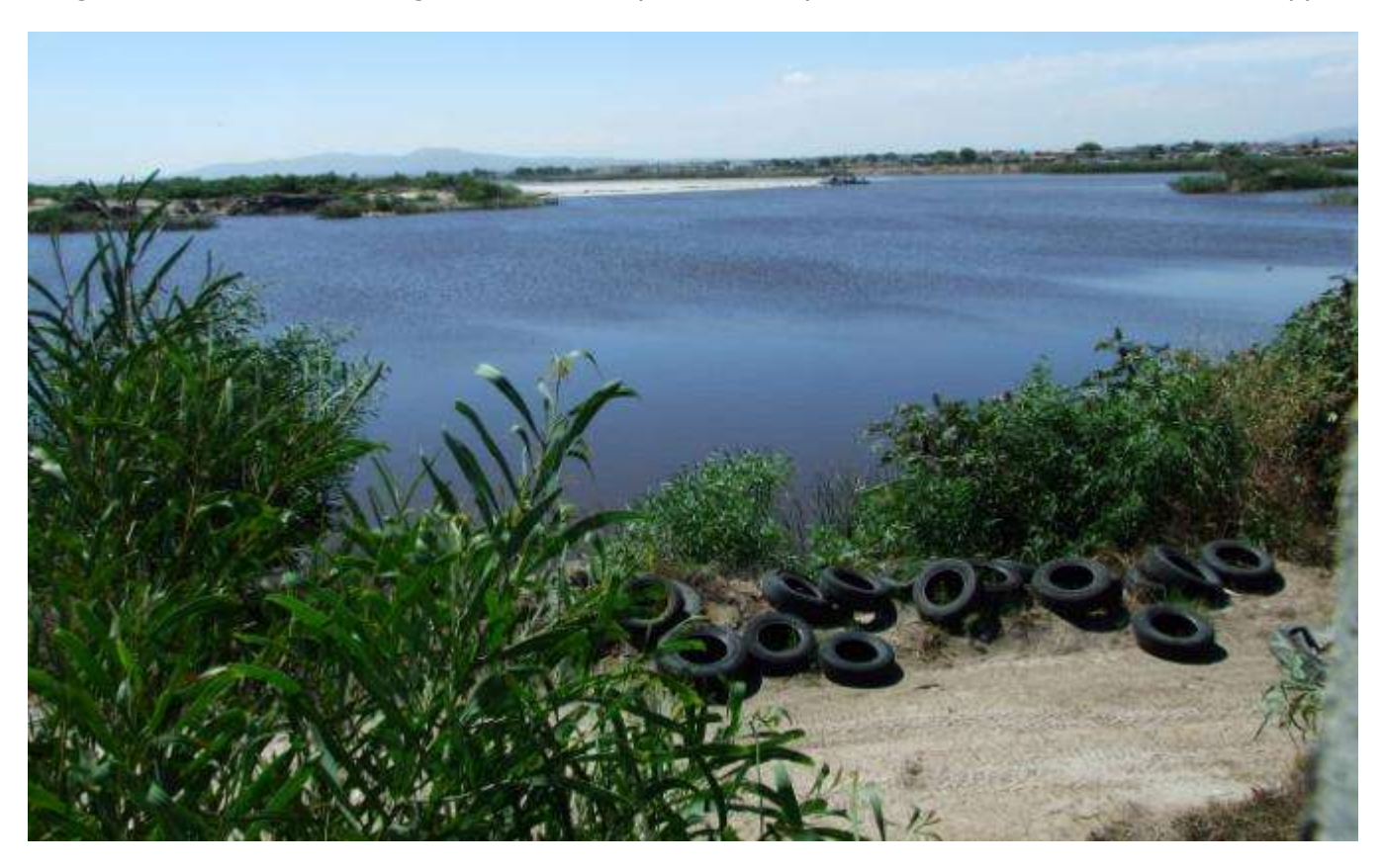
Figure 6: Man-made wetlands serve as attractants for a number of bird species in the study area