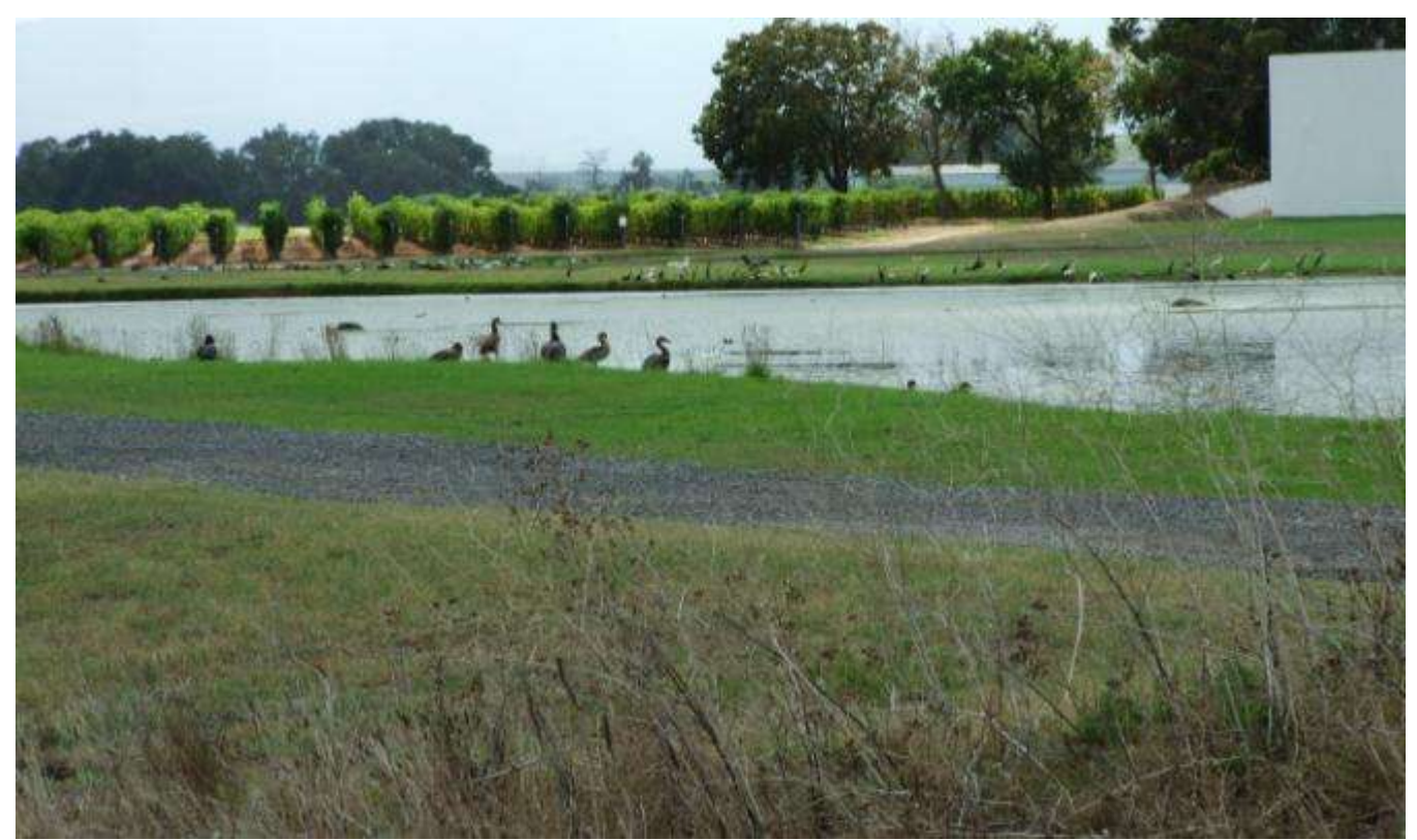
Figure 10: Artificial water bodies are an important habitat for water birds in the study area

Figure 9: Driftsands Nature Reserve is a degraded island of natural vegetation in the study area