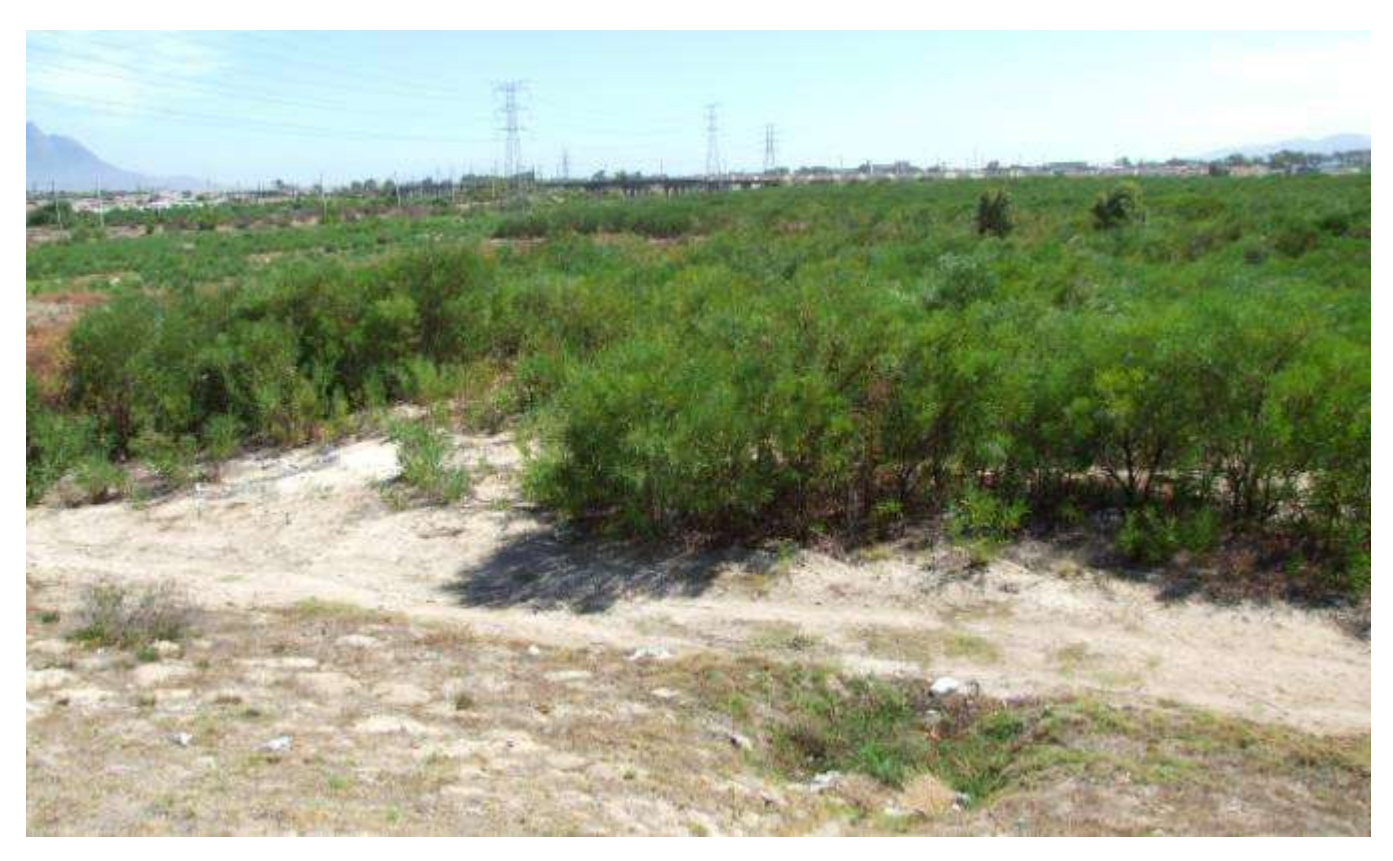
Figure 1: Typical stands of dense alien vegetation in the study area